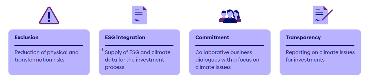
Figure 2: Four pillars of the Baloise Asset Management Climate Strategy

Our climate strategy is based on the four strategic pillars and forms an integral part of the general RI strategy and, therefore, of this policy: