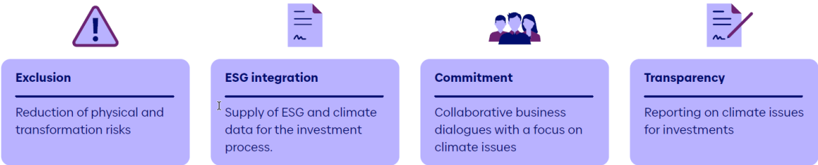
Figure 2: Four pillars of the Baloise Asset Management Climate Strategy

Our climate strategy is based on the four strategic pillars and forms an integral part of the general RI strategy and, therefore, of this policy: